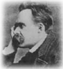
Graphic 2: Friedrich Nietzsche 1844 - 1900. "The Father of Values"

And so the verb value became the plural noun values . It was no longer objective but subjective, not something "to be" but something "to have."